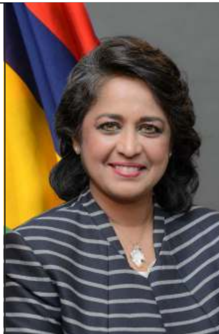
DR. (MRS.) AMEENAH GURIB-FAKIM THEN PRESIDENT OF MAURITIUS