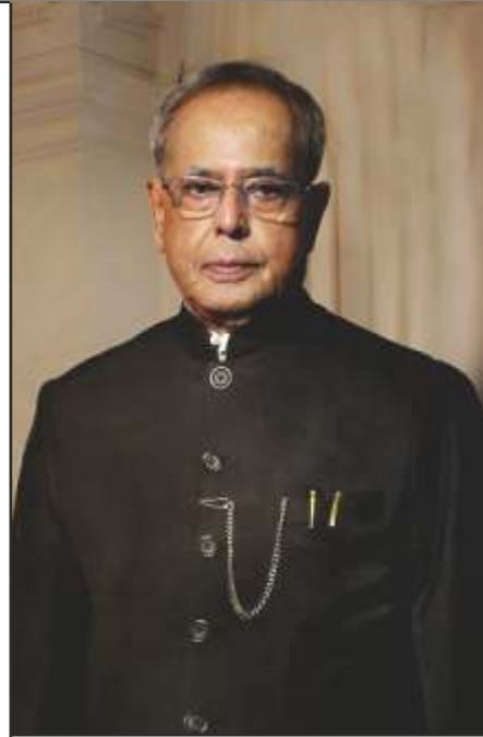
PRANAB MUKHERJEE THEN PRESIDENT OF INDIA

Inaugurated 106th Indian Science Congress