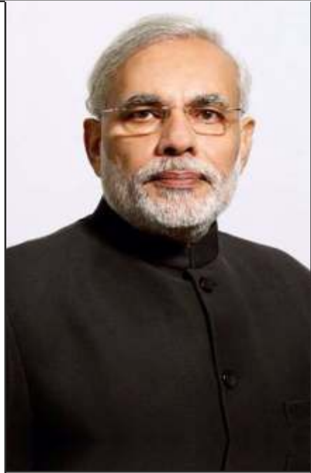
NARENDRA MODI PRIME MINISTER OF INDIA

Inaugurated 106th Indian Science Congress