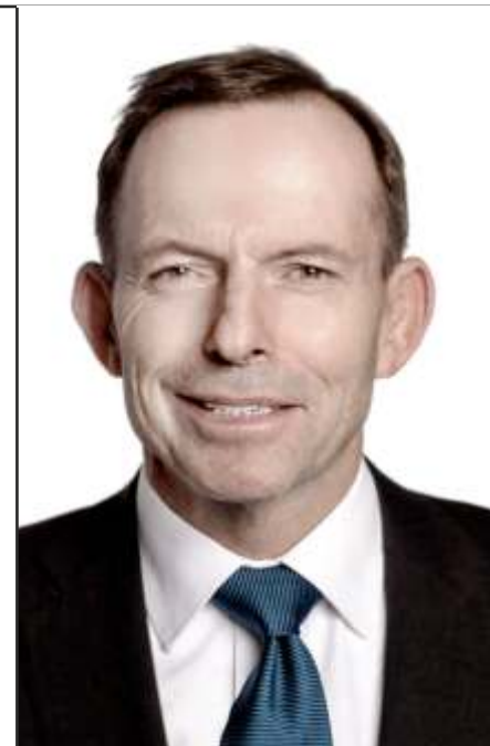
TONY ABBOT AC 28TH PRIME MINISTER OF AUSTRALIA