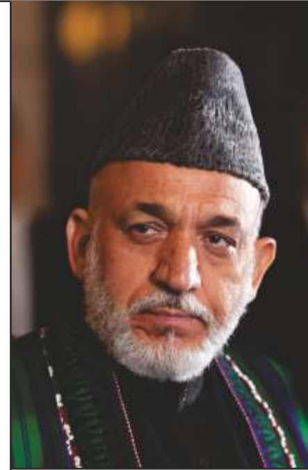
HAMID KARZAI THEN PRESIDENT OF AFGHANISTAN