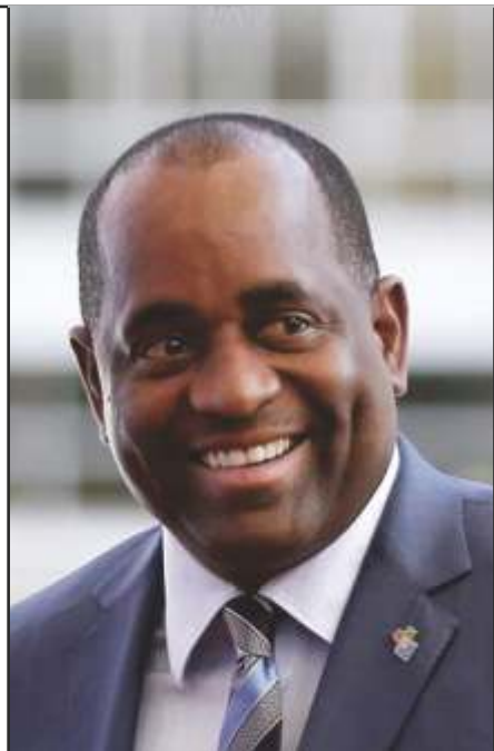
ROOSEVELT SKERRIT THEN PRIME MINISTER OF DOMINICAN REPUBLIC