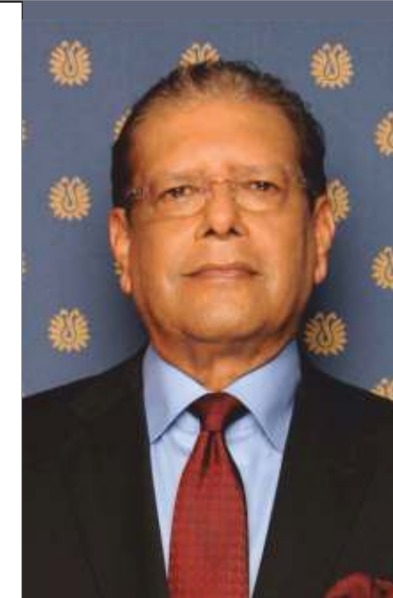
RAJKESWER PURRYAG THEN PRESIDENT OF MAURITIUS