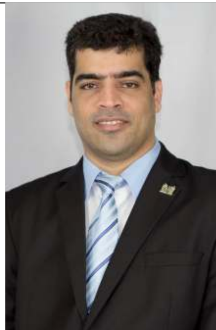
MICHAEL ASHWIN SATYANDRE ADHIN VICE-PRESIDENT OF SURINAME