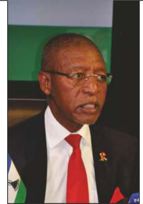
DR. PAKALITHA BETHUEL MOSISILI THEN PRIME MINISTER OF THE KINGDOM OF LESOTHO