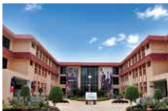
The ICFAI University, Dehradun