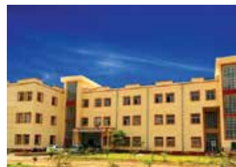
The ICFAI University, Raipur