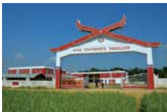
The ICFAI University, Nagaland