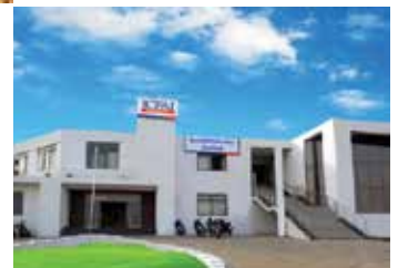
The ICFAI University, Jharkhand