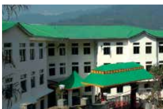
The ICFAI University, Sikkim