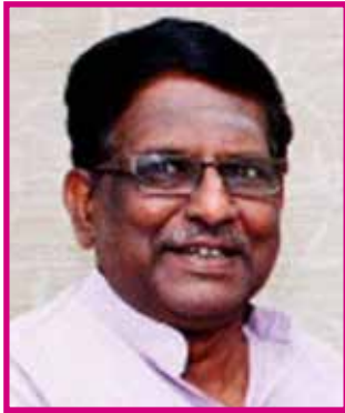
Hon'ble Shri V. Shanmuganathan Governor of Meghalaya (Relinquished Office on 27 th January 2017)