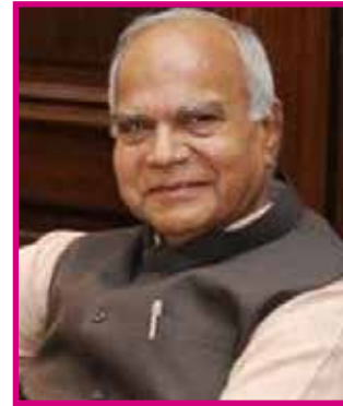
Hon'ble Shri Banwarilal Purohit Incharge Governor of Meghalaya (Assumed Office on 27 th January 2017)