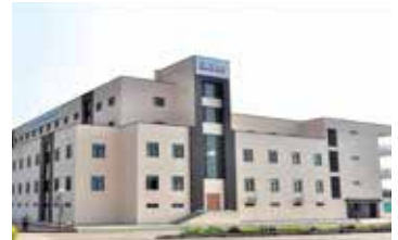
The ICFAI University, Himachal Pradesh (Baddi)