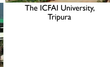
The ICFAI University, Tripura