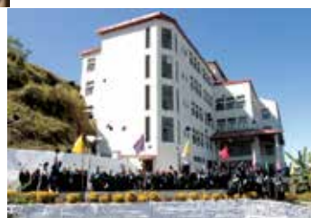
The ICFAI University, Mizoram