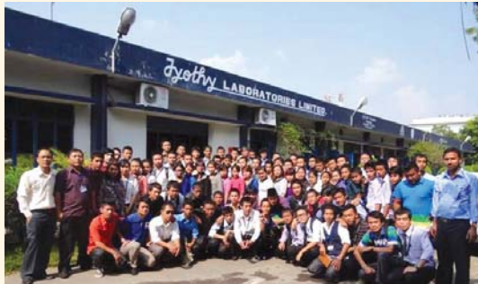
Industrial Tour Guwahati