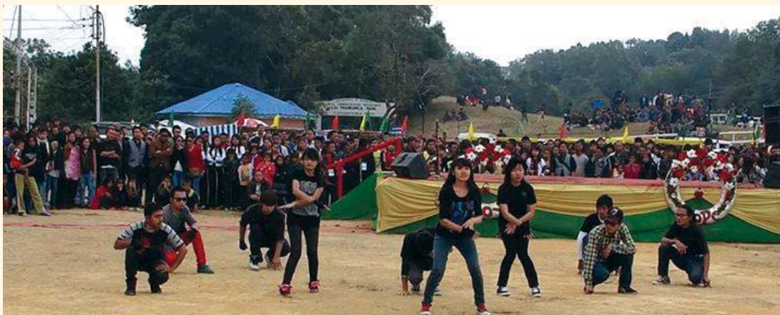
ICFAI Dance Club at Thalfavang Kut Festival