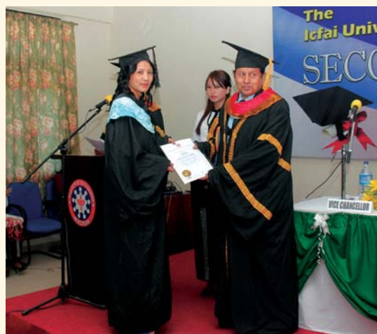
The VC conferring Degrees