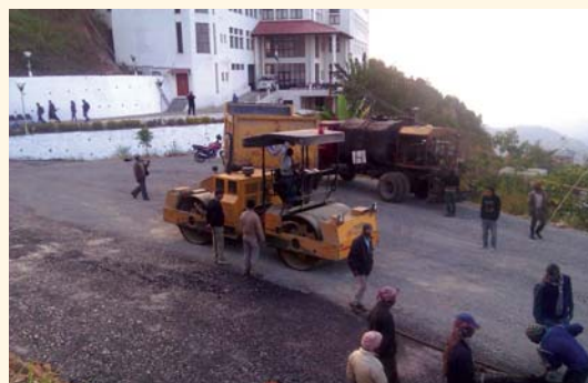
Surfacing of University Courtyard