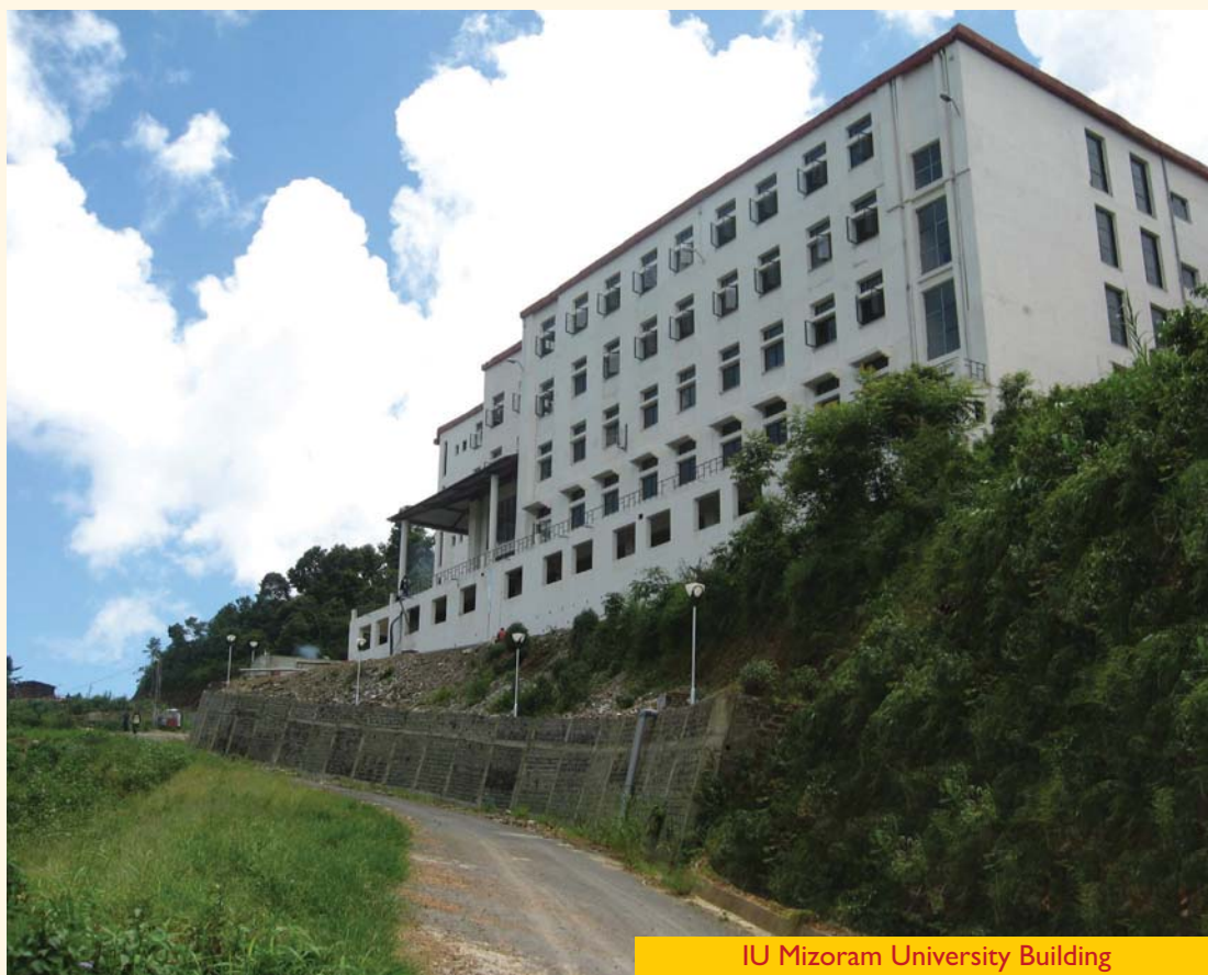
IU Mizoram University Building