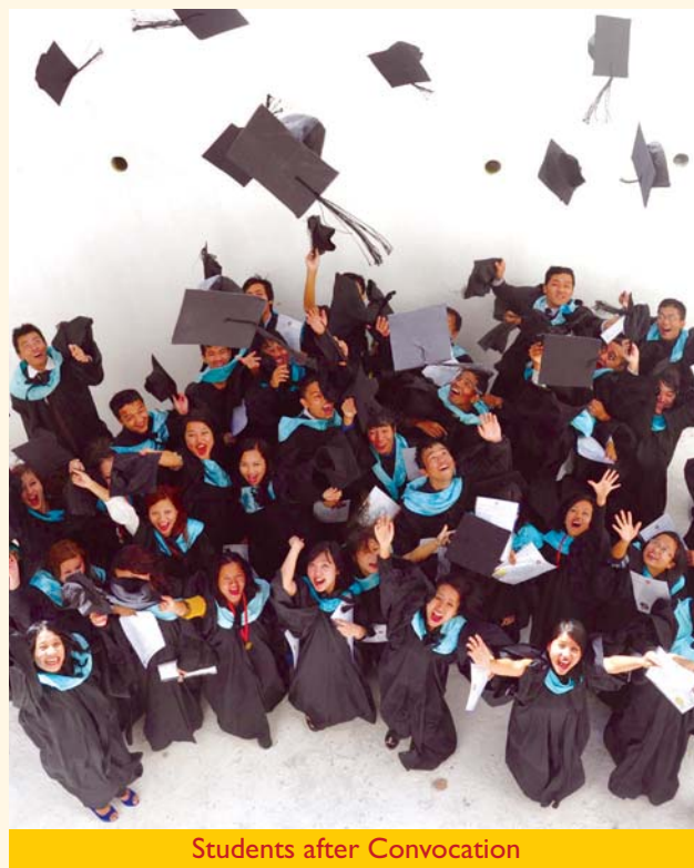
Students after Convocation

The 2014 batch of all programs have finished their exams and are expected to graduate in August, 2014.