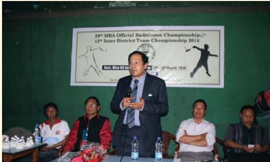
VC as the Chief Guest at the MBA Championships

5. An Inter Higher Secondary School Quiz Competition was organized in collaboration with LPS Vision, the most widely viewed cable network in Mizoram. The program was telecast live from August 6 – 20, 2013 from the LPS studio and received a good response from the public.