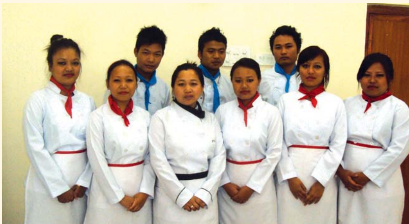
Students of the BHTM Course which is part of the Faculty of Management