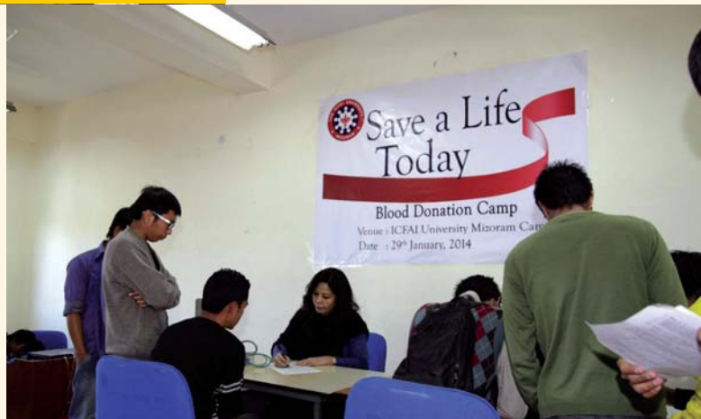
Blood Donation Screening

A blood donation camp was organized on January 29, 2014 where 44 donors donated blood for the Aizawl Civil Hospital Blood Bank.