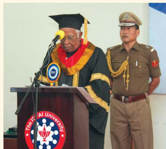
HE The Governor delivering the Convocation Address