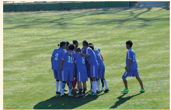
Team Huddle before the Football Finals

Recreational Facilities : The University provides recreational facilities for indoor sports like Table Tennis and Carrom Board. The University has also installed a Basket Ball Board in the court yard for the students. Clubs have been formed for activities like Dance and Photography. The University also has sports teams in Cricket Football and Basketball.