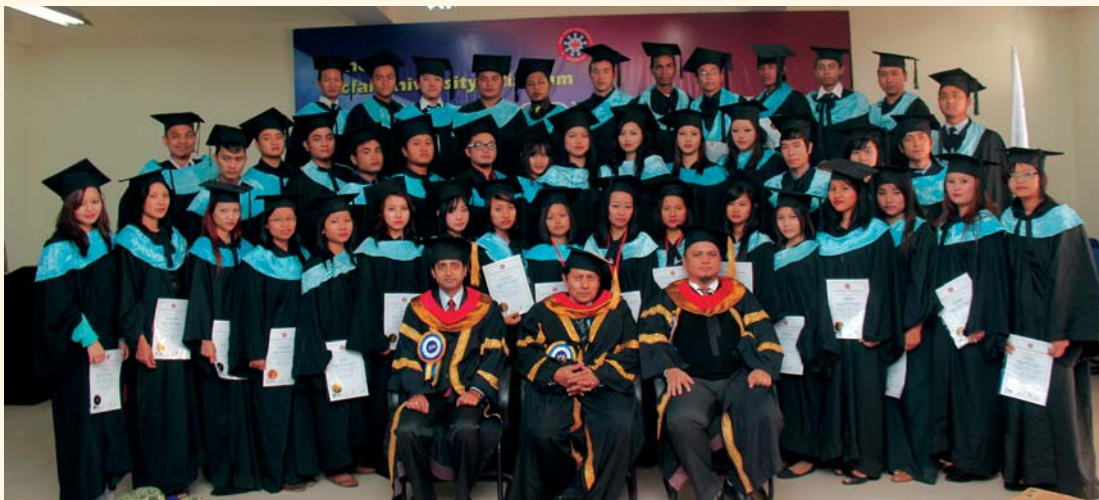
Graduates with the Vice Chancellor, Registrar and Academic Head