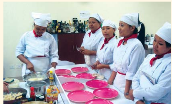
BHTM students in the Food Production Practical Room