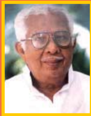
His Excellency Shri Vakkom B. Purushothaman Governor of Mizoram