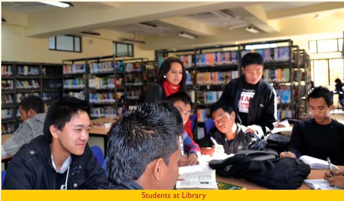
Students at Library