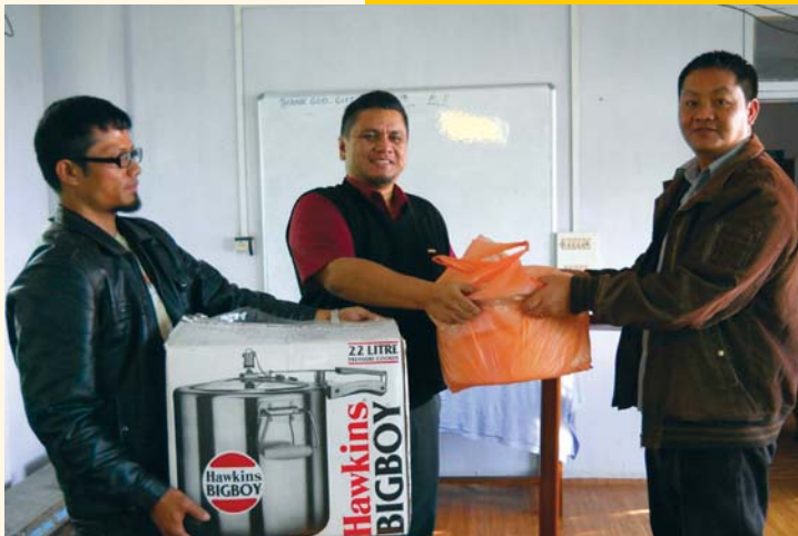
University Officials donating utensils to Grace Home

In commemoration of The World Aids Day (December 1, 2013) representatives of the University visited Grace Home, a hospice for HIV/AIDS patients. The University donated basic cooking utensils.