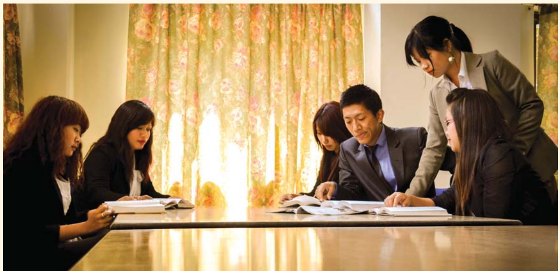
Students in Group Discussion