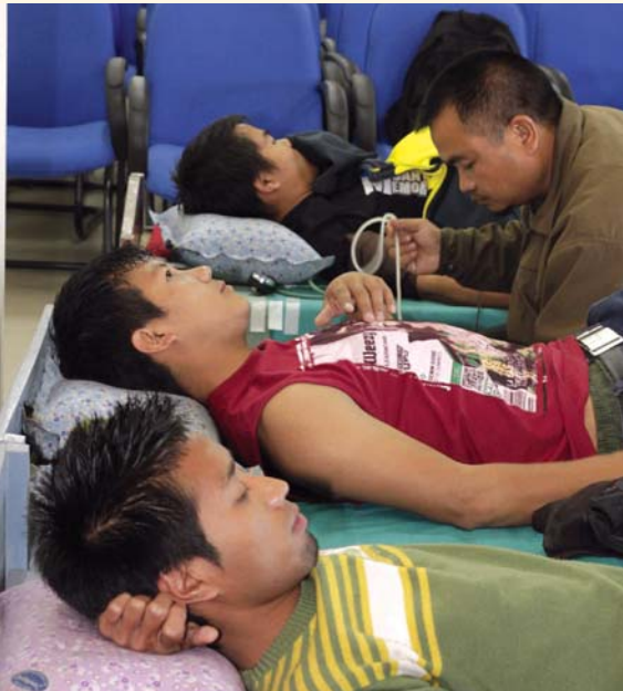
Blood Donation Volunteers

A blood donation camp was organized on January 29, 2014 where 44 donors donated blood for the Aizawl Civil Hospital Blood Bank.