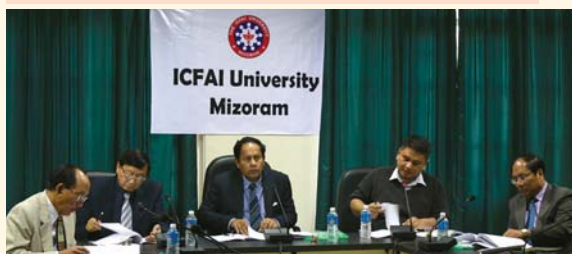
Meeting of the Board of Governors

Regular meetings of the University Authorities viz., Board of Governors, Board of Management, Academic Council and Finance Committee have been held as per statutory guidelines.