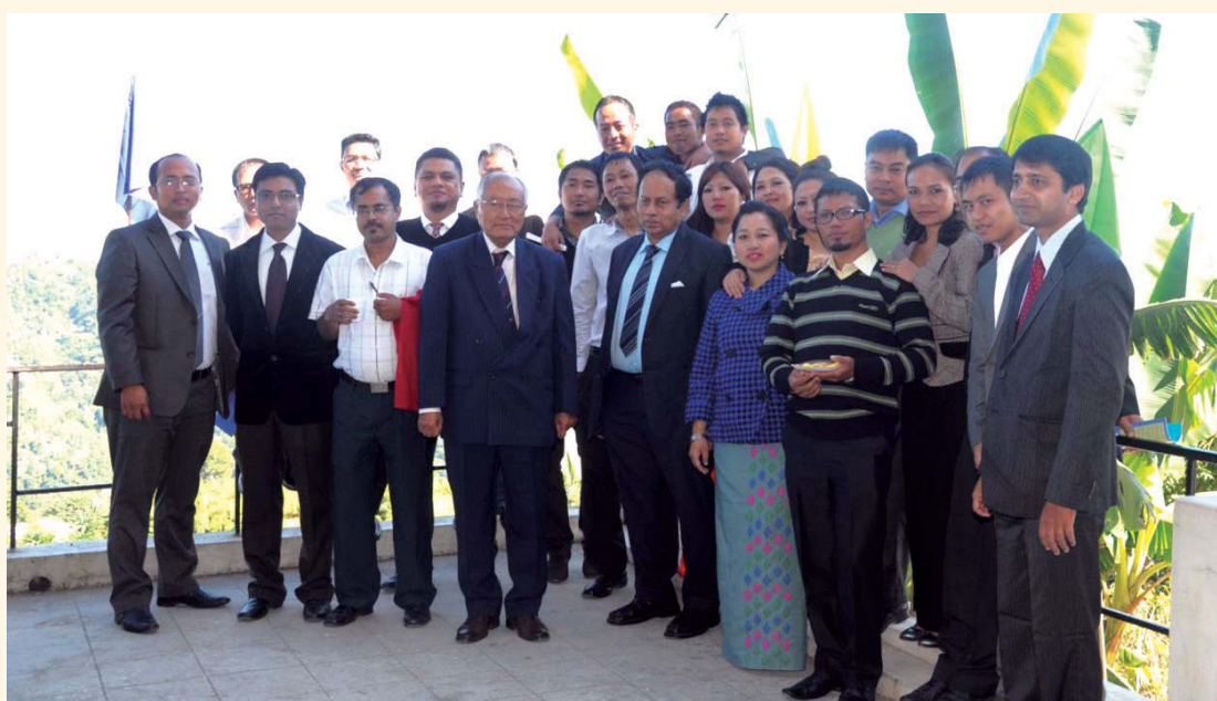
Staff and Faculty Members with the Officers of the University