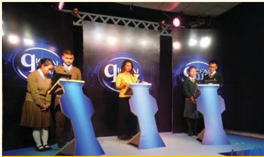
Finalists of the ICAI LPS Quiz

5. An Inter Higher Secondary School Quiz Competition was organized in collaboration with LPS Vision, the most widely viewed cable network in Mizoram. The program was telecast live from August 6 – 20, 2013 from the LPS studio and received a good response from the public.