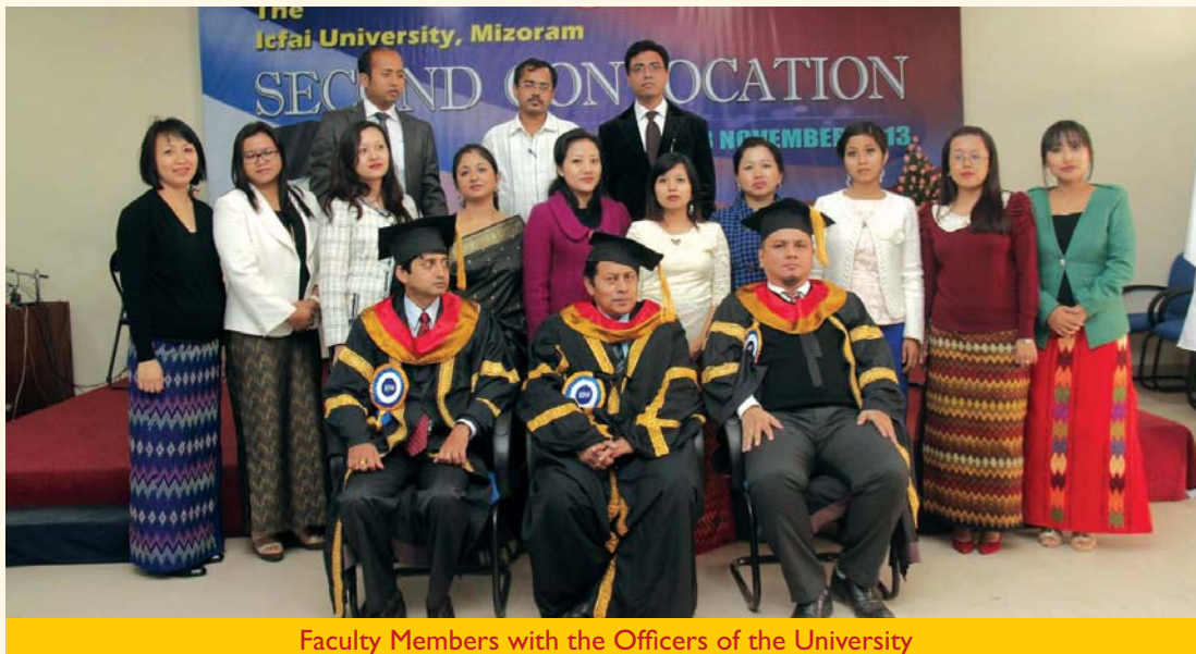
Faculty Members with the Officers of the University