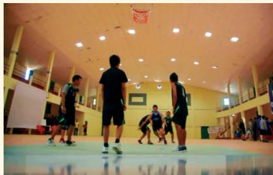
Action on the Basketball Court

3. The University Dance Club was invited by the Department of Tourism, Government of Mizoram to dance at the 'Thal Favang Kut (Festival)' an annual Mizo Festival which attracts many visitors from within and outside the state. The Secretary for the Department of Tourism was the chief guest at the event was held at Hmuifang Tourist Resort.