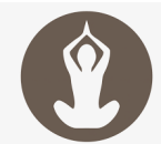
Yoga & meditation Club