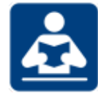
Well Equipped Library