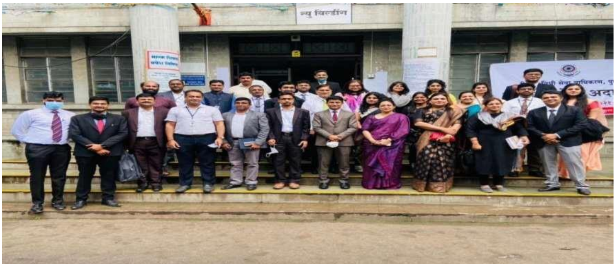
Lok Adalat Panelists, the Faculty and Associates of Symbiosis Law School, Pune